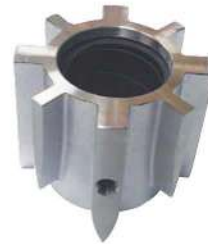
NUGGET EXTRUDING HEAD