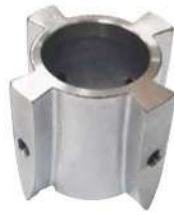
FLAKE EXTRUDING HEAD